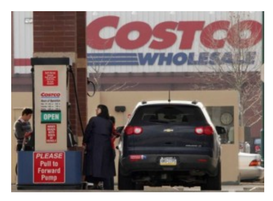
Costco club holders pumping gas outside of store in West Homestead in Pennsylvania.

A public hearing was held on Wednesday in Hempstead's Town Hall to discuss Costco Wholesale Club's plan to add a 22-pump gas station on Rockaway Turnpike in Lawrence. Concerned residents oppose the proposal because they feel as though the station would generate more traffic and potentially dangerous situations on the already busy road. Several business owners were also in attendance, expressing their concerns for the increased competition. If the proposal passes, Lawrence's Costco will be the first with a gas station on Long Island.